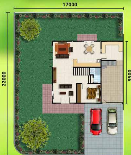
DENAH LANTAI 1