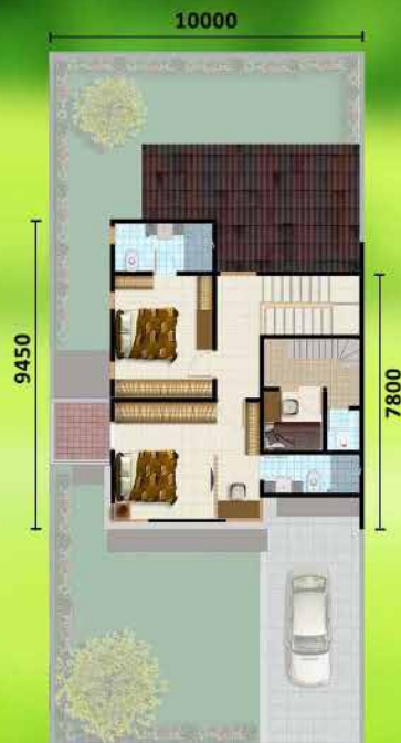
DENAH LANTAI 2