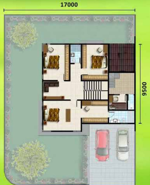
DENAH LANTAI 2