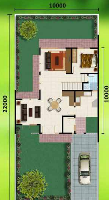
DENAH LANTAI 1