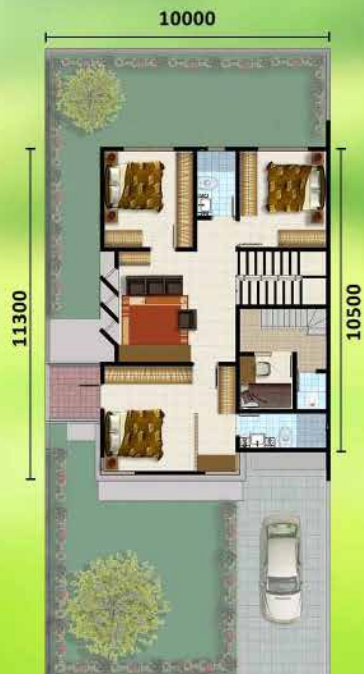
DENAH LANTAI 2