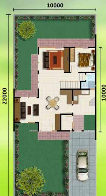
DENAH LANTAI 1